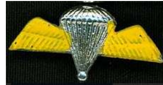
Jump status indicator