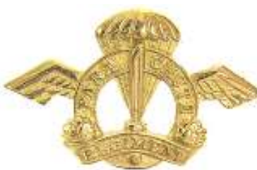
Parachute Regiment Cap Badge