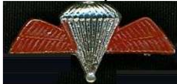
Jump status indicator