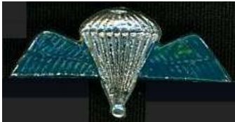
Jump status indicator