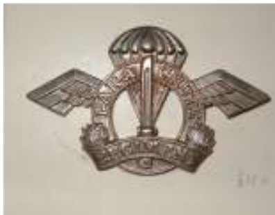
Parachute Regiment Cap Badge