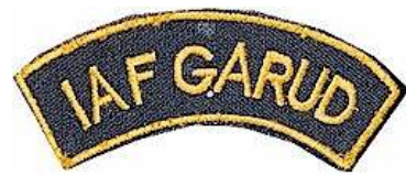
Garud Commando Force