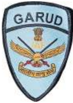
Garud Commando Force