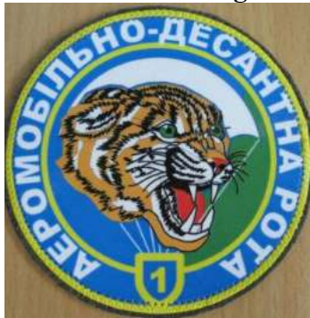
1 st airmobile