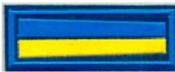
Flag breast patch Airborne troops