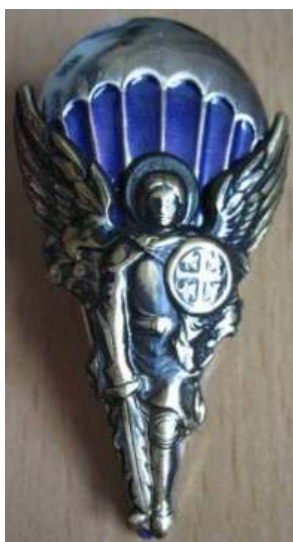
Jump wings bronze