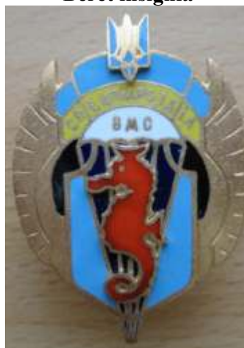
Army combat swimmer