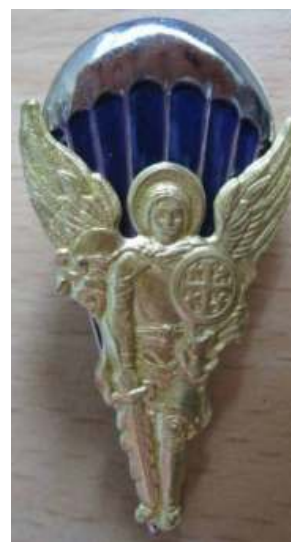
Jump wings gold