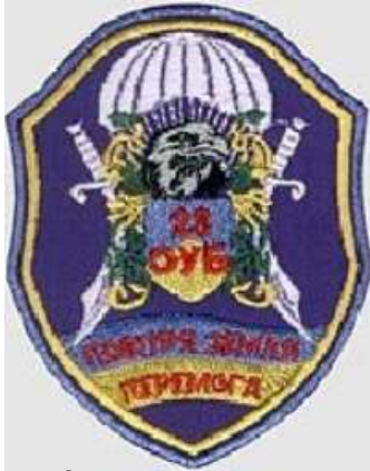
28 th training battalion