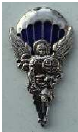
Jump wings silver