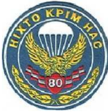
80 th airmobile regiment